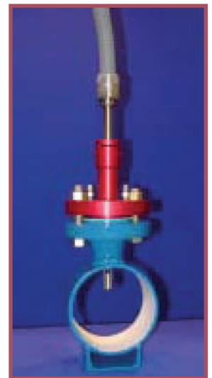
Probe shown in automatic retractable device

Free falling stream based flow cells have two major drawbacks when measuring fluorescence signal from a liquid sample; 1) the cell can be pressurized without backups in the cell thus allowing a pump to freely push the sample around the optical cell, and 2) typical 90° fluorescence measurements suffer from either an inner-filter effect or quenching, both based on sample stream composition.