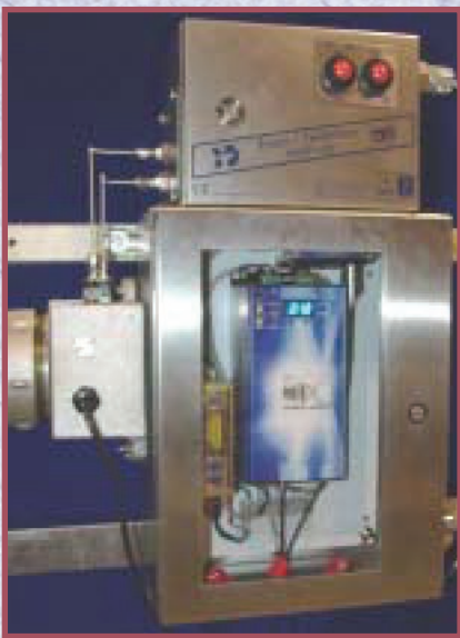
Ex-proof fiber optic based UV Photo-X fluores- cence transmitter

Most streams contain a complex mixture of many components which makes the measurement of hydrocarbons in water challenging. This challenge can be met by using Teledyne's Photo-X Fluorometer. The Photo-X Fluorometer detects the aromatic fraction of; dissolved, dispersed, and emulsified hydrocarbons in water. The Fluorometer is unaffected by bubbles or suspended solids because of its front surface probe design (patent pending). Offering this unique immunity to real process conditions and having the ability to provide insitu measurements sets Teledyne apart from the competition.